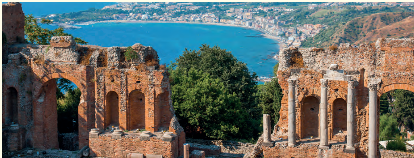
Greek amphitheater, Taormina