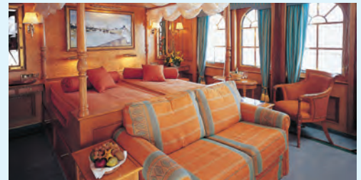
Deluxe Cabin (top) and Owner's Suite (above)