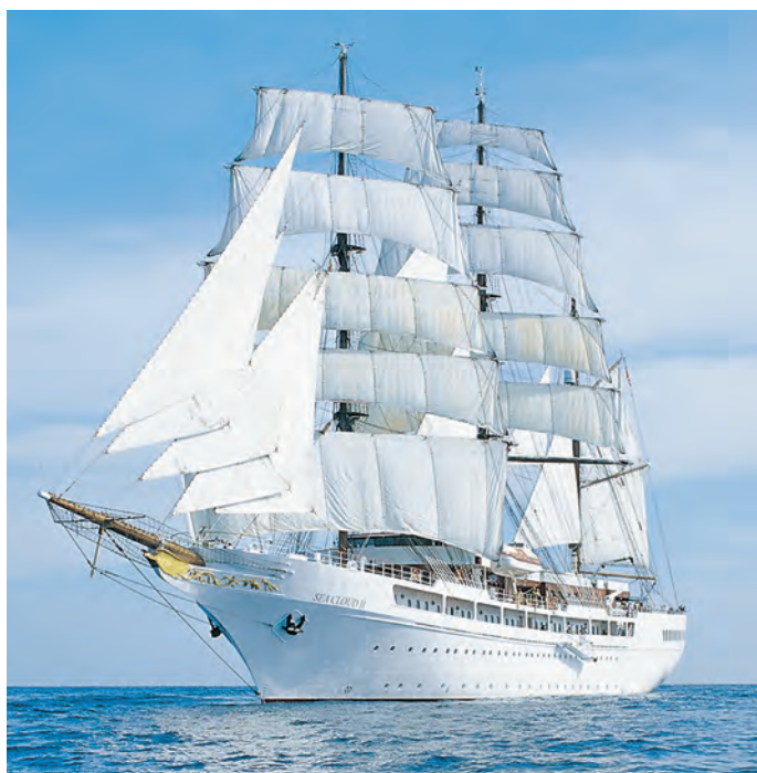
Sea Cloud II

Sicily’s capital was the envy of Europe under the Normans, whose enlightened rule produced the golden mosaics we will see in the 12th-century Palatine Chapel. At the Regional Gallery, view the chilling, plague-inspired fresco, The Triumph of Death ; and admire the brilliant mosaics in the nearby Norman cathedral in Monreale. Continue to a special reception at the Palazzo Gangi, where the ballroom scene in The Leopard was filmed. B, L, R, D