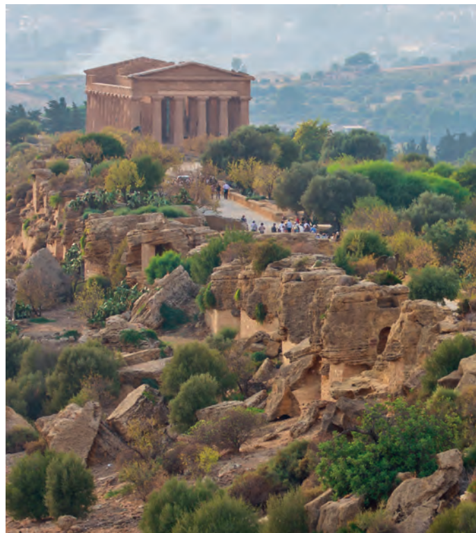
Valley of the Temples, Agrigento

Pindar called Agrigento “the most beautiful city built by mortal men” and the nearby ruins of the Valley of the Temples demonstrate why. The Temple of Concord, perhaps the best-preserved Greek temple in the world, inspired UNESCO’s logo. Tonight the captain hosts a welcome reception and dinner. B, L, R, D