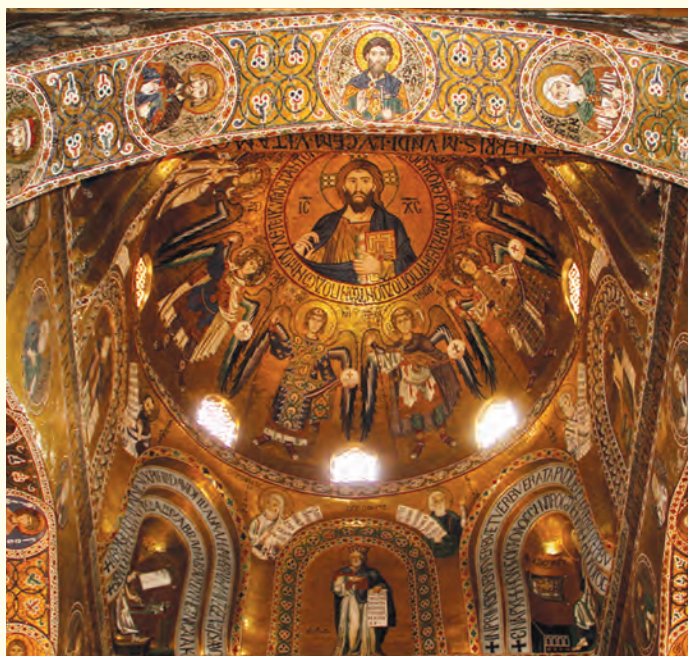
Palatine Chapel, Palermo